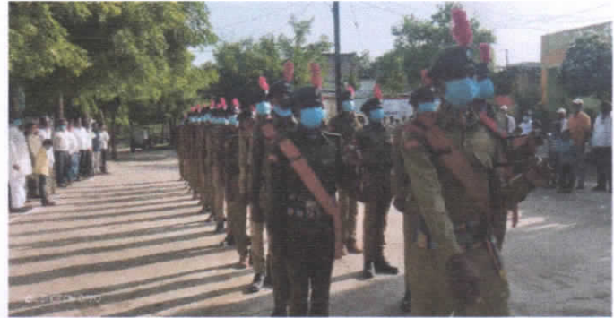
Pilot Drill on Independent day Celebrated in Our College