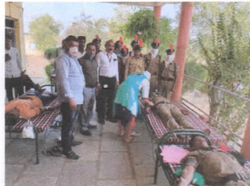
Blood Donation camp organised at college