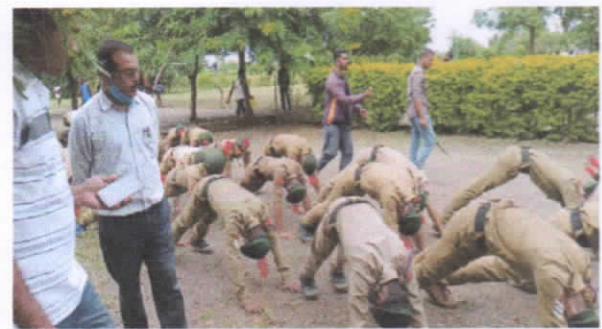
Our college conducts NCC drill training programme twice in a week