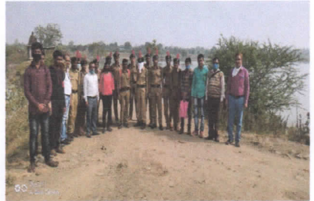
Forest tracking in Katepurna forest