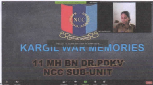
Kargil Vijay Divas Celebrated in College