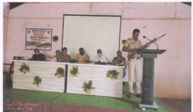
Workshop organized on weapon handling for cadets by Dept. of Police